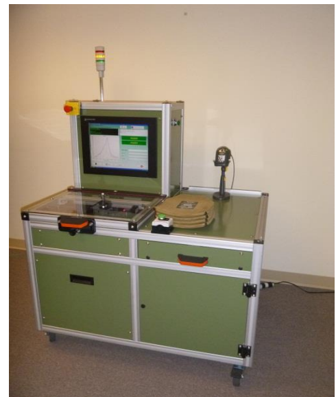
Figure 1: Deviations of the resonance peak caused by delamination in ceramic plate (left). Black lines are good plates, red line is a delaminated plate. RUV quality control tool for body armor plates (right)

The RUV method to inspect delamination is based on a statistical approach. In case studies, the capture rate of RUV method approaches 100%.